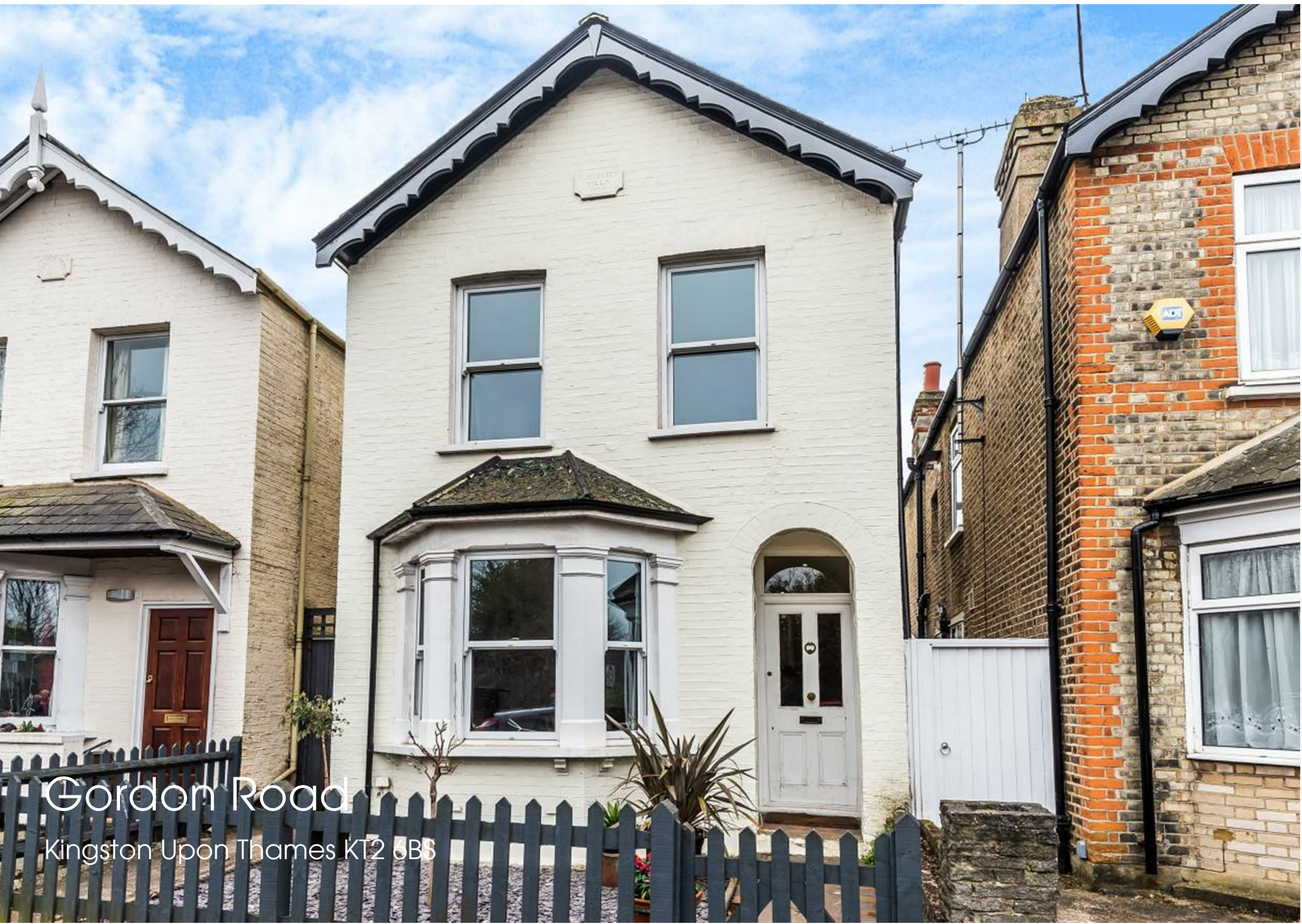
Gordon Road Kingston Upon Thames KT2 6BS